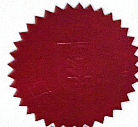
Dekan Fakulti Kejuruteraan Awam & Alam Sekitar Universiti Tun Hussein Onn Malaysia